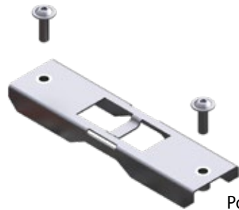
Pole Bracket STP