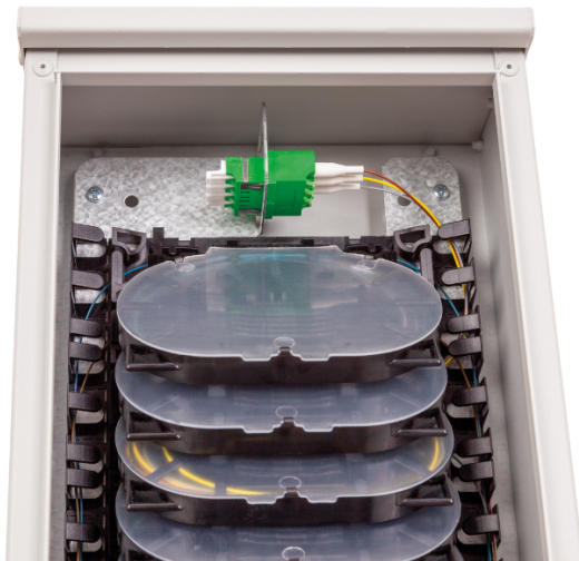
Fiber Optic Trays KM 3