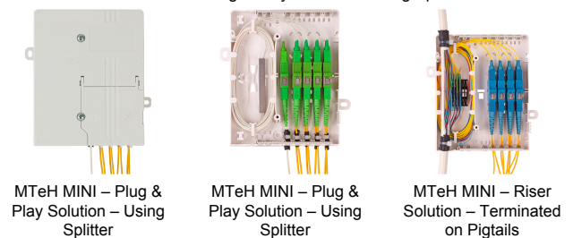
MTeH MINI – Plug & Play Solution – Using Splitter