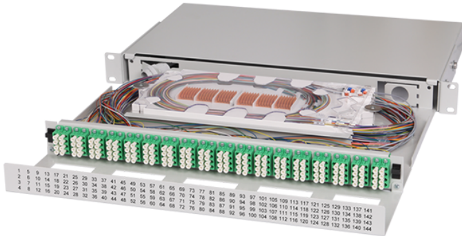
Ultra High Density Fiber Optic Patch Panel UHD ORMP 1U 144LC