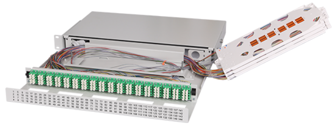
Ultra High Density Fiber Optic Patch Panel UHD ORMP 1U 144LC (removed trays)